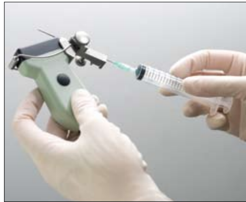
3-angle needle guides let YOU choose the angle

As always, BK Medical equipment is designed with cleaning and sterilization in mind.