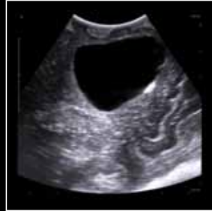
Parasitic brain cyst in sagittal plane – using craniotomy transducer