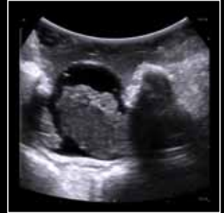
Intraoperative imaging of spinal tumor in transverse plane using craniotomy transducer