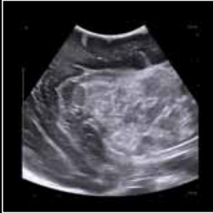
Large brain tumor evaluated during surgery using craniotomy transducer