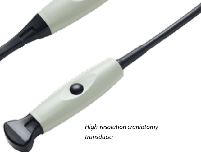
High-resolution craniotomy transducer