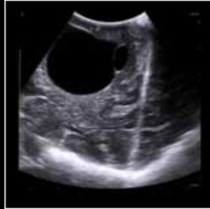
Parasitic brain cyst in coronal plane – using craniotomy transducer