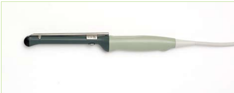
The 8819 needle guide helps simplify intervention.

Ergonomic and slim design for comfortable use. The 8819's long, slim design minimizes the discomfort of a transvaginal examination.