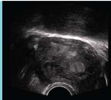
Endovaginal scan of uterus showing large suspicious mass.